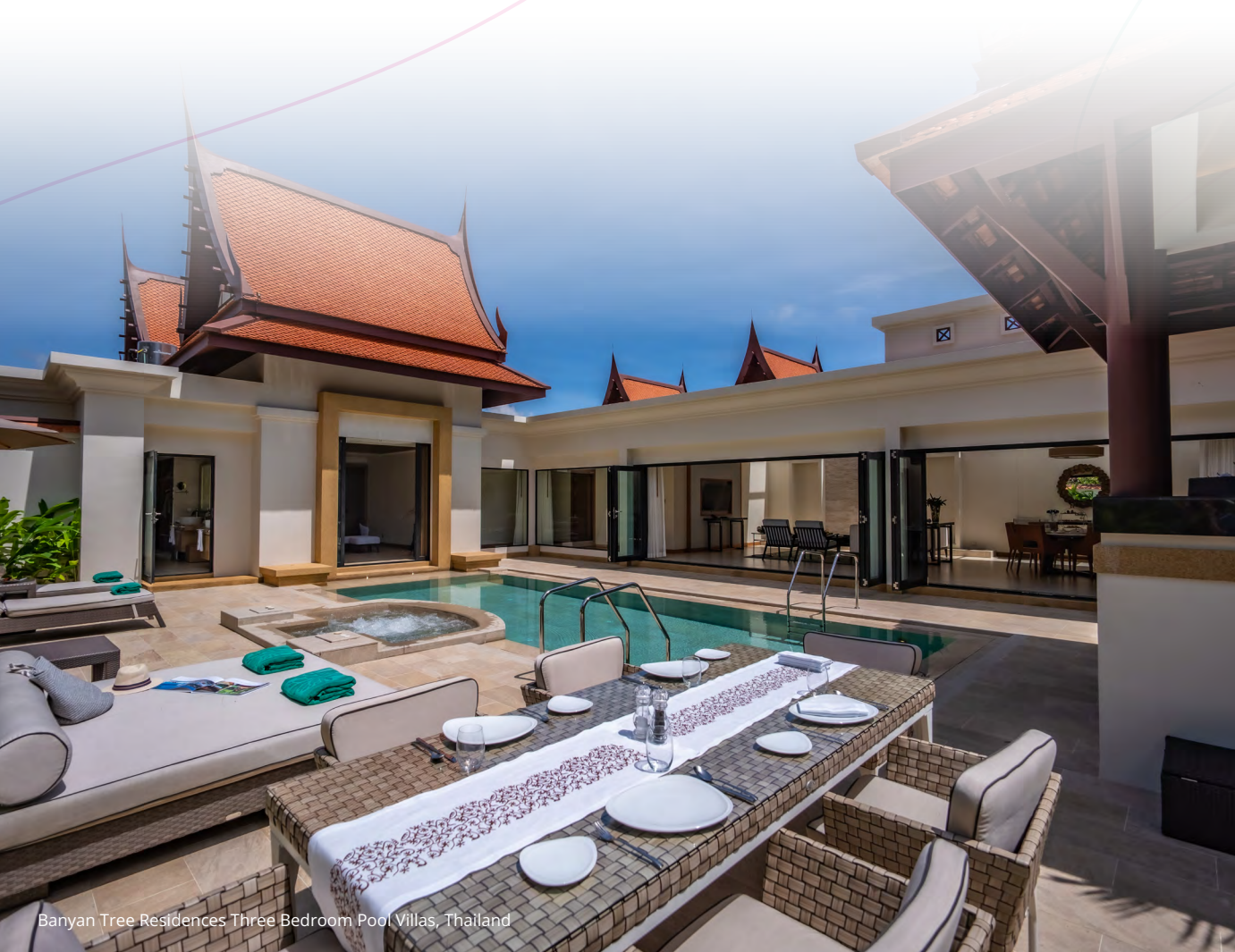
Banyan Tree Residences Three Bedroom Pool Villas, Thailand

Its continued success has been consistently recognized through the years with numerous environmental and tourism awards.