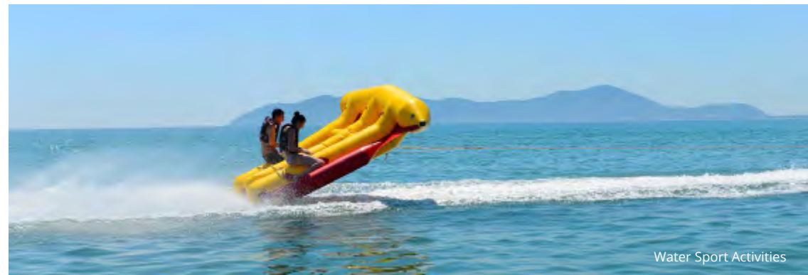
Water Sport Activities