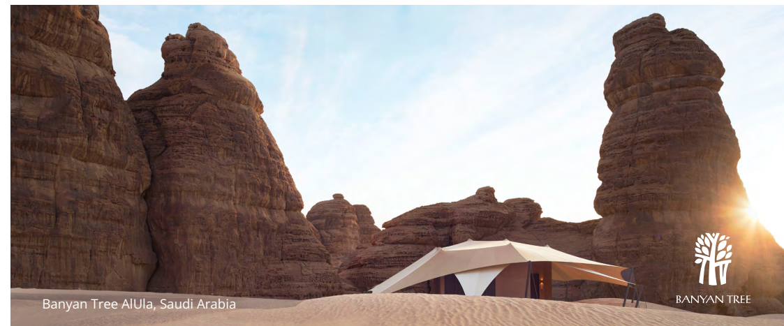
Banyan Tree AlUla, Saudi Arabia