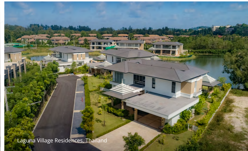
Laguna Village Residences, Thailand