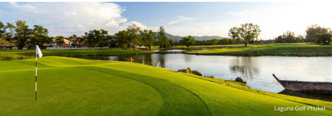
Laguna Golf Phuket