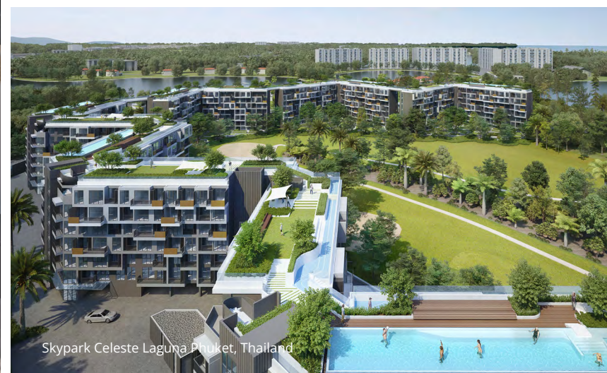
Skypark Celeste Laguna Phuket, Thailand