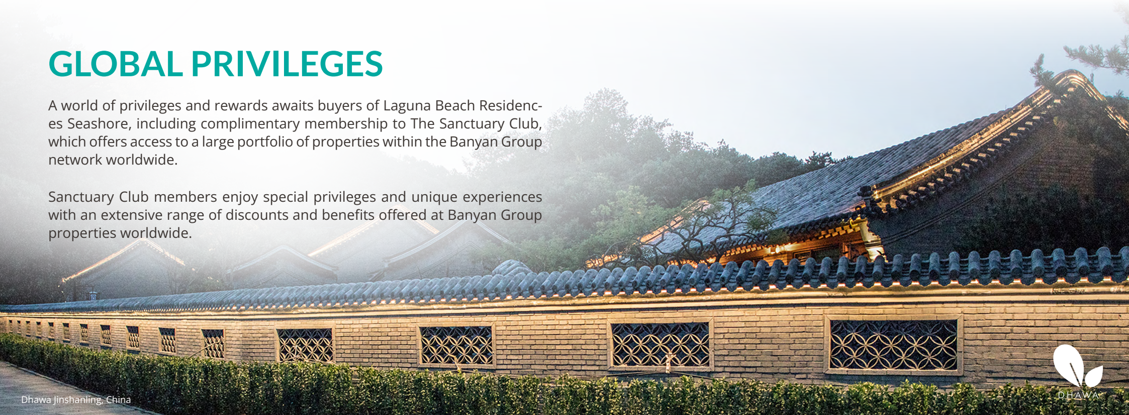
Dhawa Jinshanling, China

Sanctuary Club members enjoy special privileges and unique experiences with an extensive range of discounts and benefits offered at Banyan Group properties worldwide.