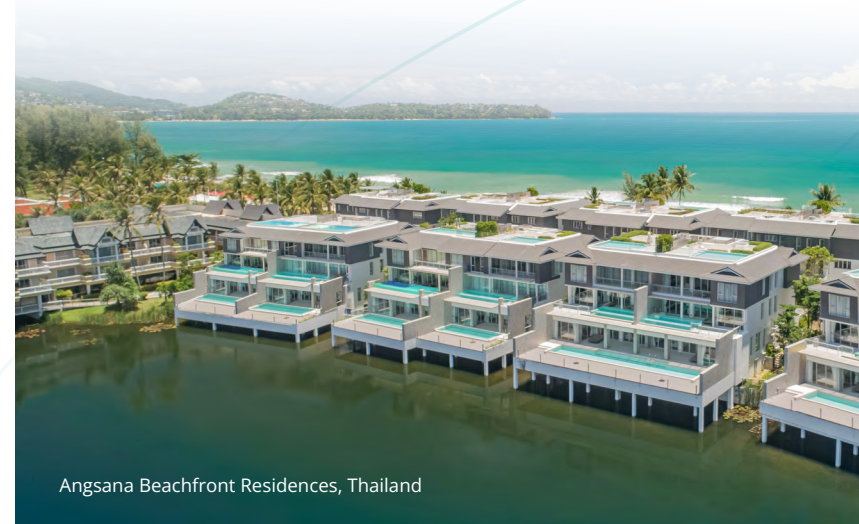
Angsana Beachfront Residences, Thailand