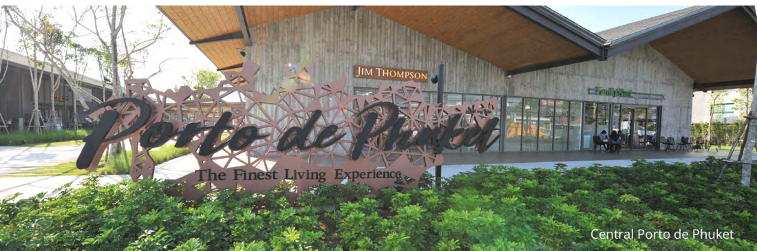
Central Porto de Phuket